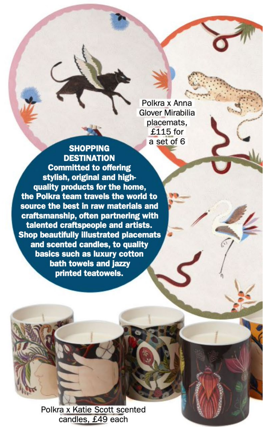
Polkra x Anna Glover Mirabilia placemats, £115 for a set of 6

SHOPPING DESTINATION Committed to offering stylish, original and high-quality products for the home, the Polkra team travels the world to source the best in raw materials and craftsmanship, often partnering with talented craftspeople and artists. Shop beautifully illustrated placemats and scented candles, to quality basics such as luxury cotton bath towels and jazzy printed teatowels.